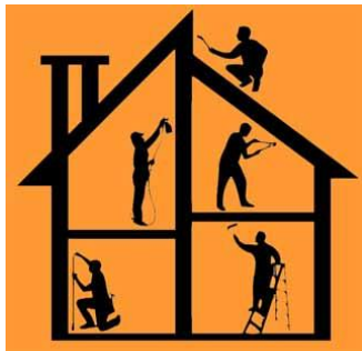
Owner Occupied Housing Rehab.

It is anticipated that financing will be Conditional Grants. You may be required to pay back a portion if you do not live in the home as your primary residence for at least 5 years.